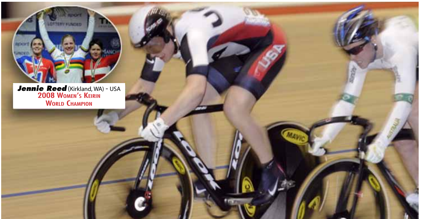
Jennie Reed (Kirkland, WA) - USA 2008 WOMEN'S KEIRIN WORLD CHAMPION